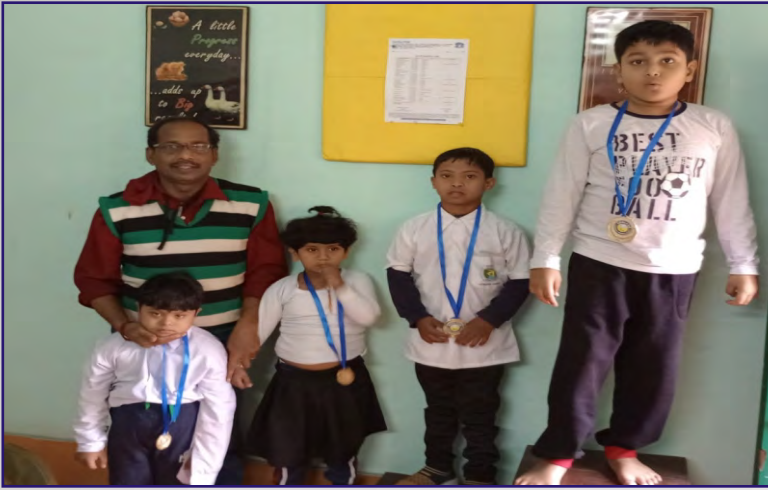
Prize distribution of Sports