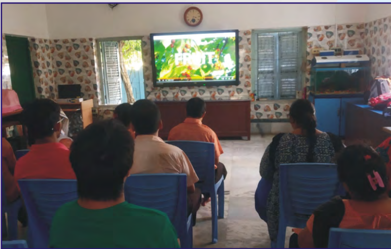
Training through Smart Board