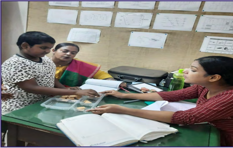
Speech Therapy Session