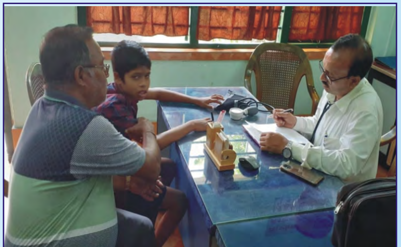
Medical Checkup by Psychiatrist