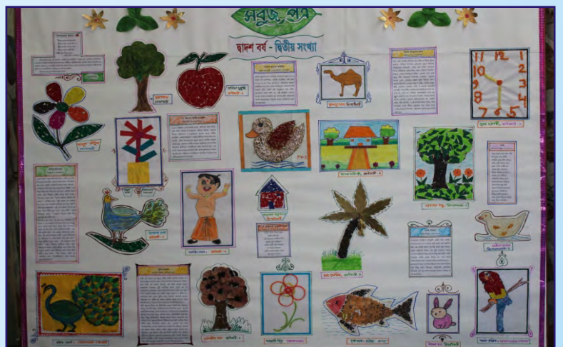
Wall Magazine by Students