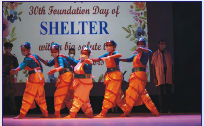
Foundation Day Celebration