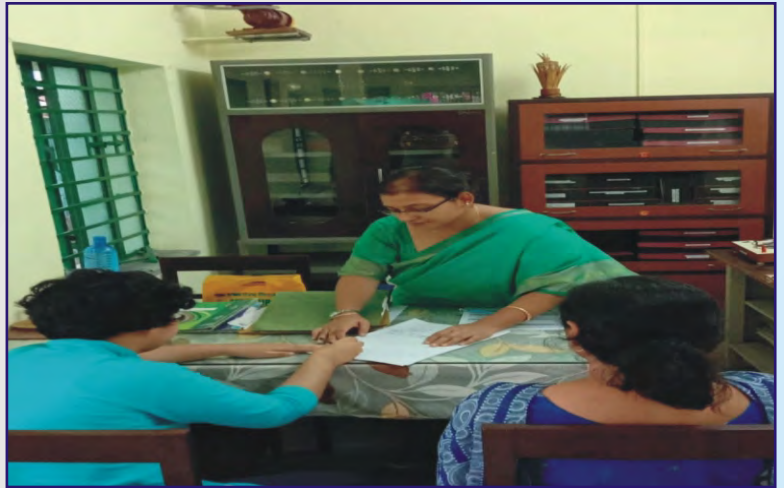
Psychological Testing Session