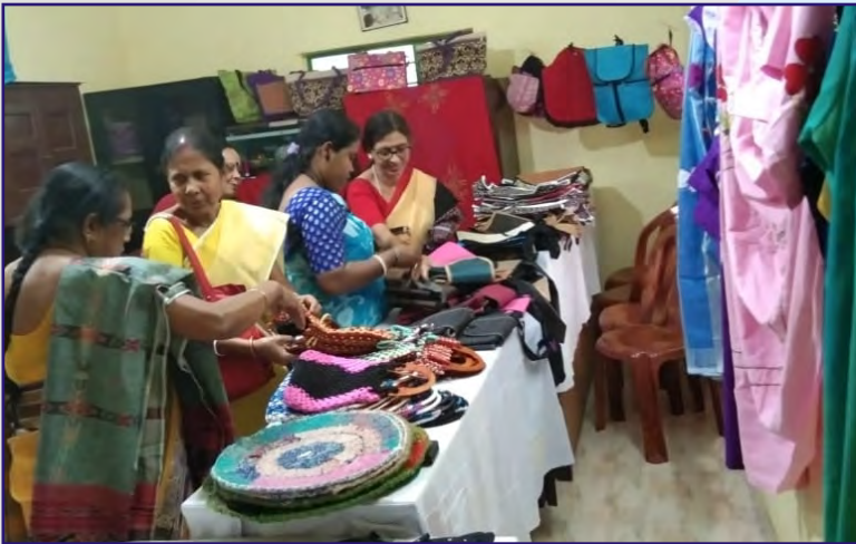
Exhibition of products of Vocational Unit