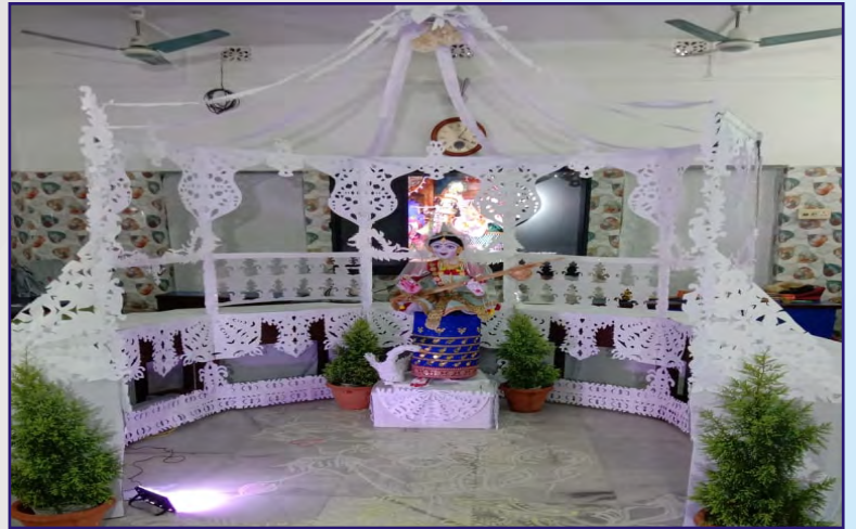
Saraswati Puja at School